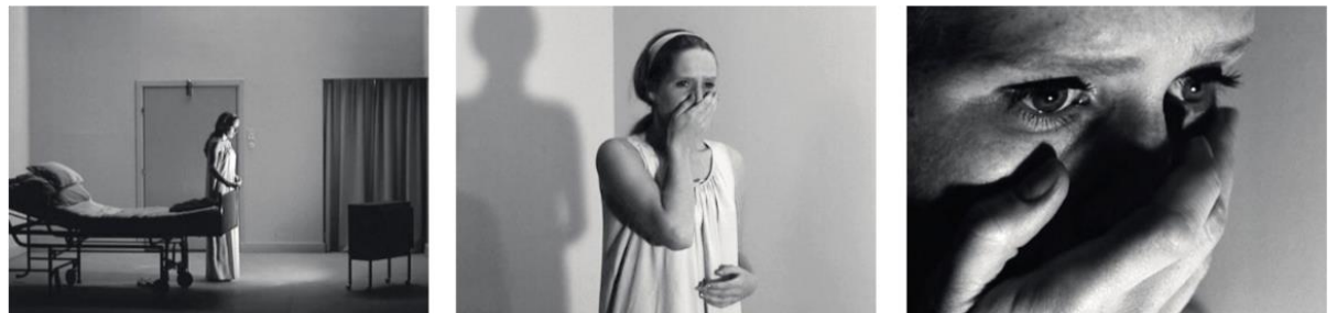
Figure 4. The arrangement of the camera's distance from the subject that results in variations in image size in cinematography.