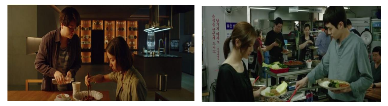
Figure 9. Setting arrangement that shows the kitchen setting

the film is made, so that it can be more attractive to shape the culture of the community or group of people who watch it.