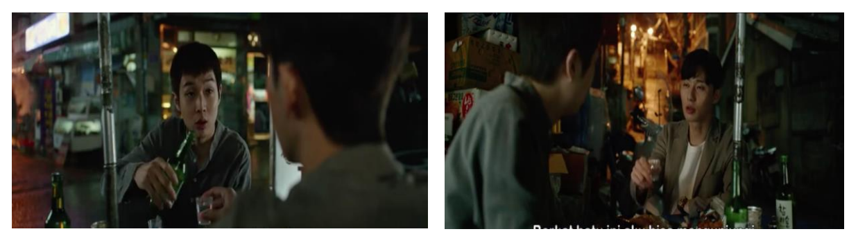
Figure 11. The sequence of images in the Parasite movie scene