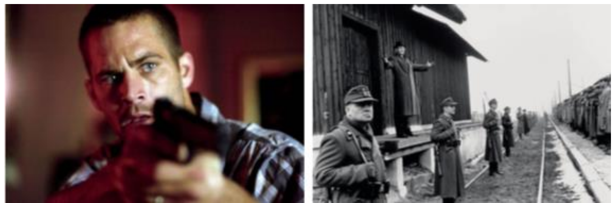
Figure 5. The use of lenses in giving perspective to the depth of the image in cinematography