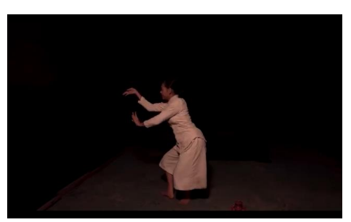
Figure 5. The presence of Gorontalo's classical phrase in the new creation virtual dance Tinelo Eya