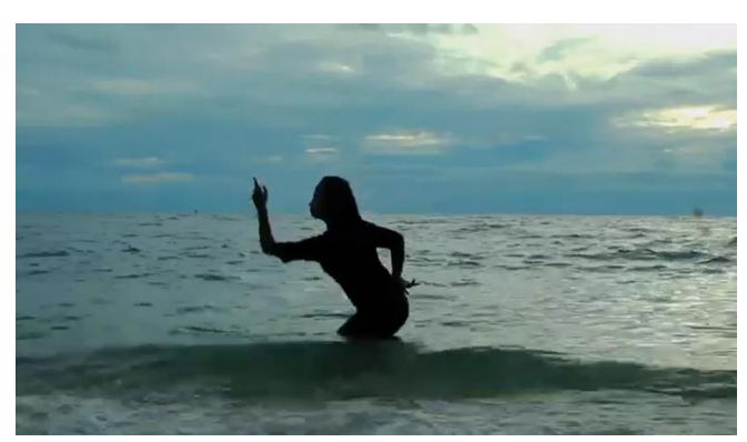
Figure 1. The notion of subtle motion in the real natural dance space in Paneo's Melarat