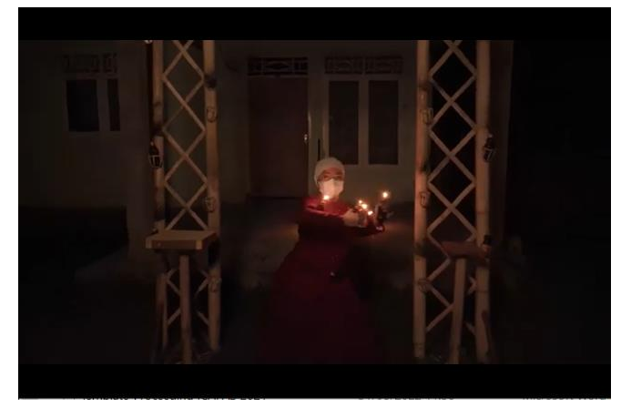
Figure 6. The presence of Gorontalo's traditional event in the new creation virtual dance Tumbilotohe