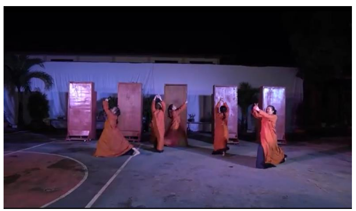
Figure 2. The facing direction play in Pomontolo's Mo Sikola using only natural light provided by Kinemaster