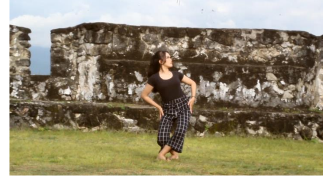
Figure 3. One of the static designs in Maele's Suram , showing a delicate statue-like gesture that requires a proper technique to do