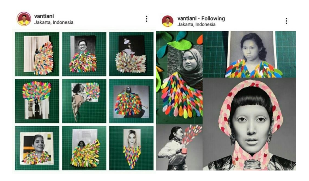
Figure 1. Custom made collage artwork from Puan Bantu Puan art initiative

transgender friends and communities and posting it online. In the Puan Bantu Puan project, almsgiver can contribute by ordering Ika's collage artwork, which are tailor-made for each individual. People can send prints of their chosen photographs to then be turned into a handmade and customized collage artwork as can be seen here in Figure 1. There was a total of four batches of the Puan Bantu Puan art donation project, stretching from March to November 2020, with each batch limited to a total of five collage pieces due to the fact that it is a custom handmade artwork that requires a lot of time and craftsmanship to produce. The Puan Bantu Puan project, donated 85% of each artwork proceeds to Sanggar Seroja, a creative space for transgender communities and groups to channel their artistic talents, located in Kampung Duri, Jakarta formed in 2016 (Irham, 2018) and also to several other transgender community in Yogyakarta.