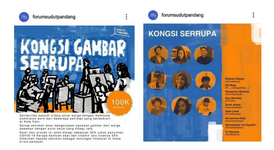
Figure 5. Second Batch of Ilustrasi Donasi announced in July 2021

system in Palu, they initiated a The Kongsi Gambar Serrupa as way to contribute in helping those affected by the situation. There are nine artists involved and almsgiver can commission an artwork, drawing or illustrations based on their requested image or photographs as can be seen here in Figure 5. The proceeds from the Gambar Kongsi Serrupa project is then used for cross-subsidies where 50% of the income is donated to aid medicine and vitamins for Covid-19 survivors and the other 50% is given to artists as a financial support during the pandemic.