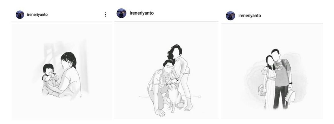
Figure 2. Custom illustration from Ilustrasi Donasi art initiative

and leaving the faces blank. This visual style presents quite an interesting approach which can be related to the concept of donation and anonymity. The artworks for Ilustrasi Donasi can be seen here in Figure 2.