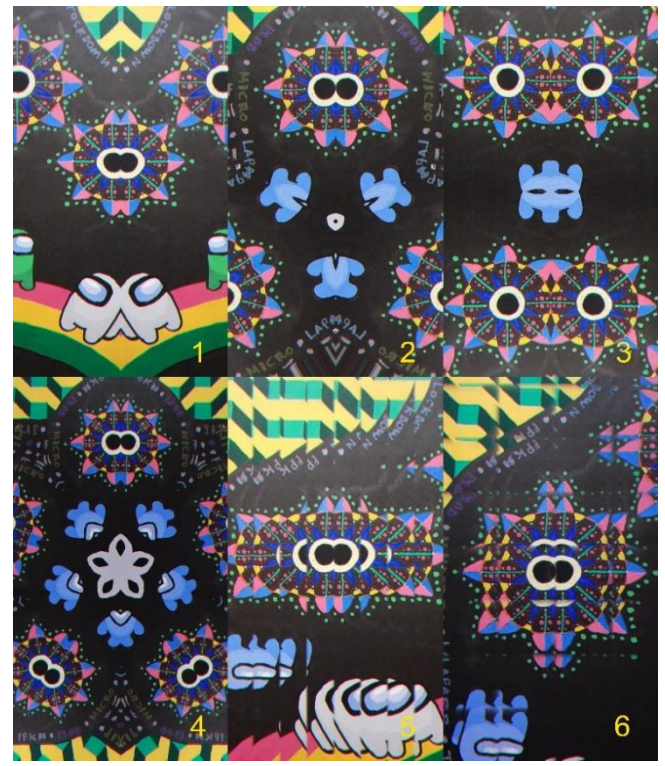
Figure 3. Various Mirror Filter: (1) Two Mirror, (2) Three Mirror, (3) Four Mirror, (4) Six Mirror, (5) Multiple Horizontal Mirror, and (6) Multiple Box Mirror.

The expected results were found on the visuals of Corona virus. The artist only drew three images but the characteristics of the duplication in the filter made the visuals seem more than the actual objects, especially when it was combined with camera movement by which the movement and duplication occurred to create beauty.