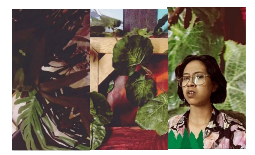
Figure 4. Creative process of Failed Paradise (from left to right)

What has been found in the use of Reveal Background filter is that this work does not only become a visual presentation, but also has performativity value in it where the responses manifested into a form of one's sensitivity to a certain space and resulted in gestures adapting to the existing background. This is also because this filter does require the presence of a subject to activate.